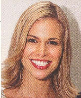
Brooke Burns fractures her neck while diving into a pool.